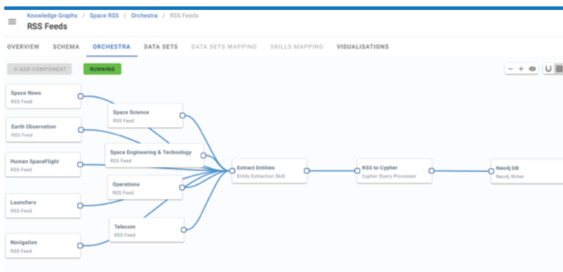
Hume Orchestra workflow

“The ability to customise Hume Actions via Cypher queries provided ESA with flexibility to cover a range of use cases and customers.”